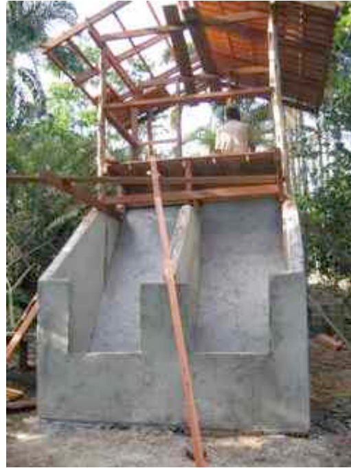
Building a Ferro-Cement Composting Toilet